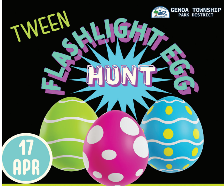
CHAMBERLAIN PARK - 8:00 PM - REGISTRATION REQUIRED $5.00 RESIDENT $6.00 NON-RESIDENT AGES: 10-15 YRS, OLD

Date: Saturday, April 12th Time: 10:00 am for ages 24 mo. & under and 2-4 10:30 am for ages 5 and above Location: Chamberlain Park