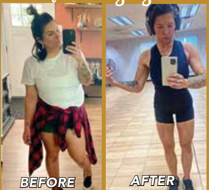
Since her New Year 2023 Meltdown, her progress is now 56 pounds lost (33%) and 91.5 Inches lost so far (25%)!